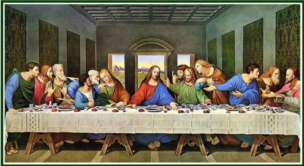
The twelve apostles as the twelve signs: “The Last Supper”, a symbolic painting by Leonardo Da Vinci.

The Old Testament is full of allusions to the twelve zodiacal signs, and the whole scheme is built upon it - heroes, personages, and events.