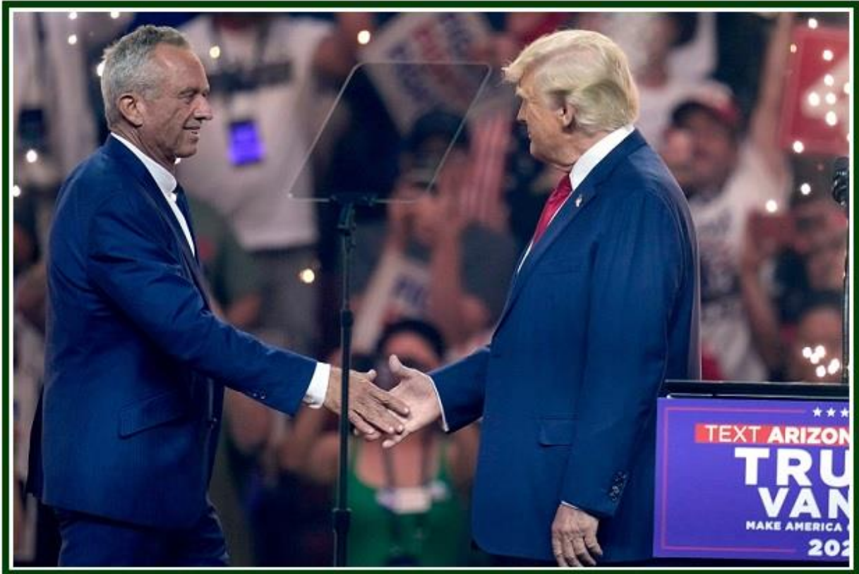
Robert Kennedy Jr. and DJT

A friendly reader sends a message and makes a consultation: he is worried about the political and social Karma in North America.