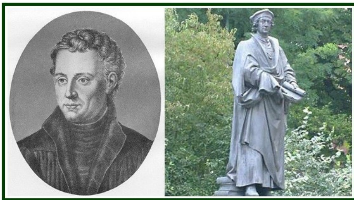
Reuchlin; a portrait and his statue at his hometown, Pforzheim, Germany

German humanist and kabalist John Reuchlin was born under the sign of Pisces. He came into the physical world on 22nd February 1455 and died five centuries ago in 1522. [1]