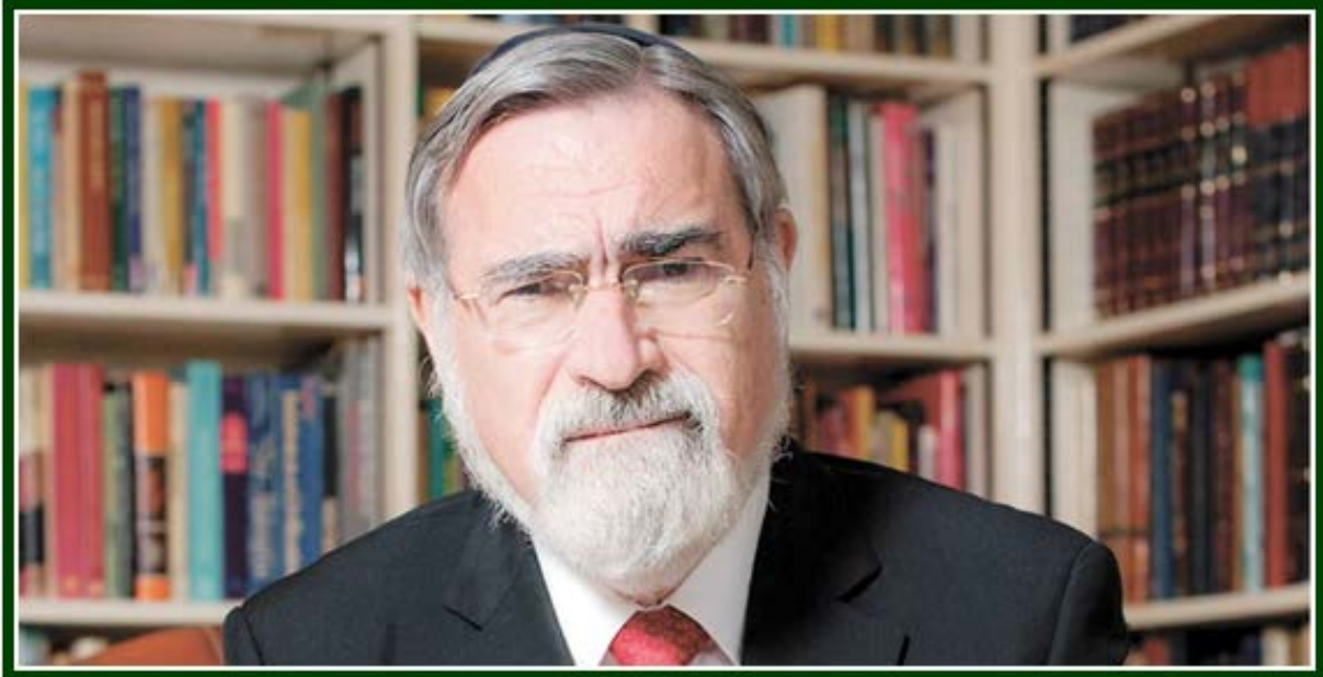
Rabbi Jonathan Sacks

[The book “To Heal a Fractured World”] is about the faith I love and the people I know, but this too I know: that goodness and virtue are widely distributed throughout humanity.