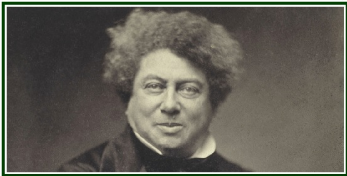
Alexandre Dumas, senior (1802-1870)

T he more we advance in life, the more we advance in art, the more convinced we become that nothing is abrupt and isolated; that nature and society progress by evolution and not by chance, and that the event, flower joyous or sad, perfumed or fetid, beneficent or fatal, which unfolds itself to-day before our eyes, was sown in the past, and had its roots sometimes in days anterior to ours, even as it will bear its fruits in the future.