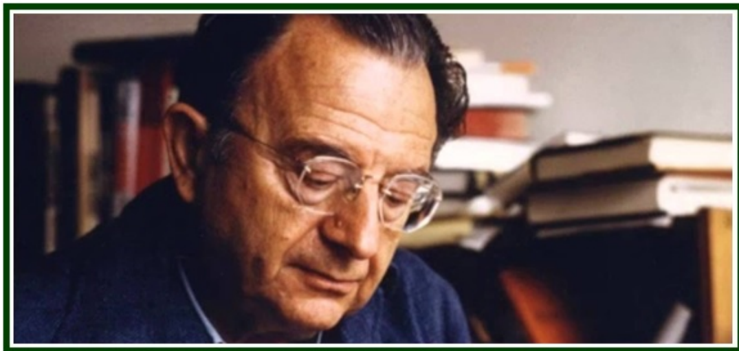
Erich Fromm (1900-1980)

There has been a dialogue among a few students of theosophy regarding ethics, occultism and the Ningma sect, which HPB wrote is inimical both to the evolution of human soul and to the masters of the wisdom and their disciples.