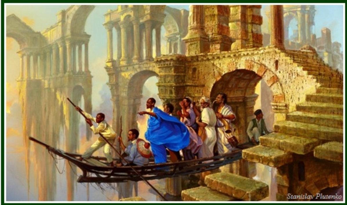
Hard work is not a bad thing, says the neo-stoic philosopher Musonius Rufus